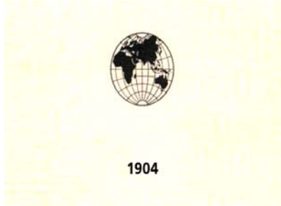
FIFA Corporate Mark 1904