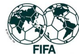
FIFA Corporate Mark 1978

Globes are reversed to traditional double globe formation due to printing error